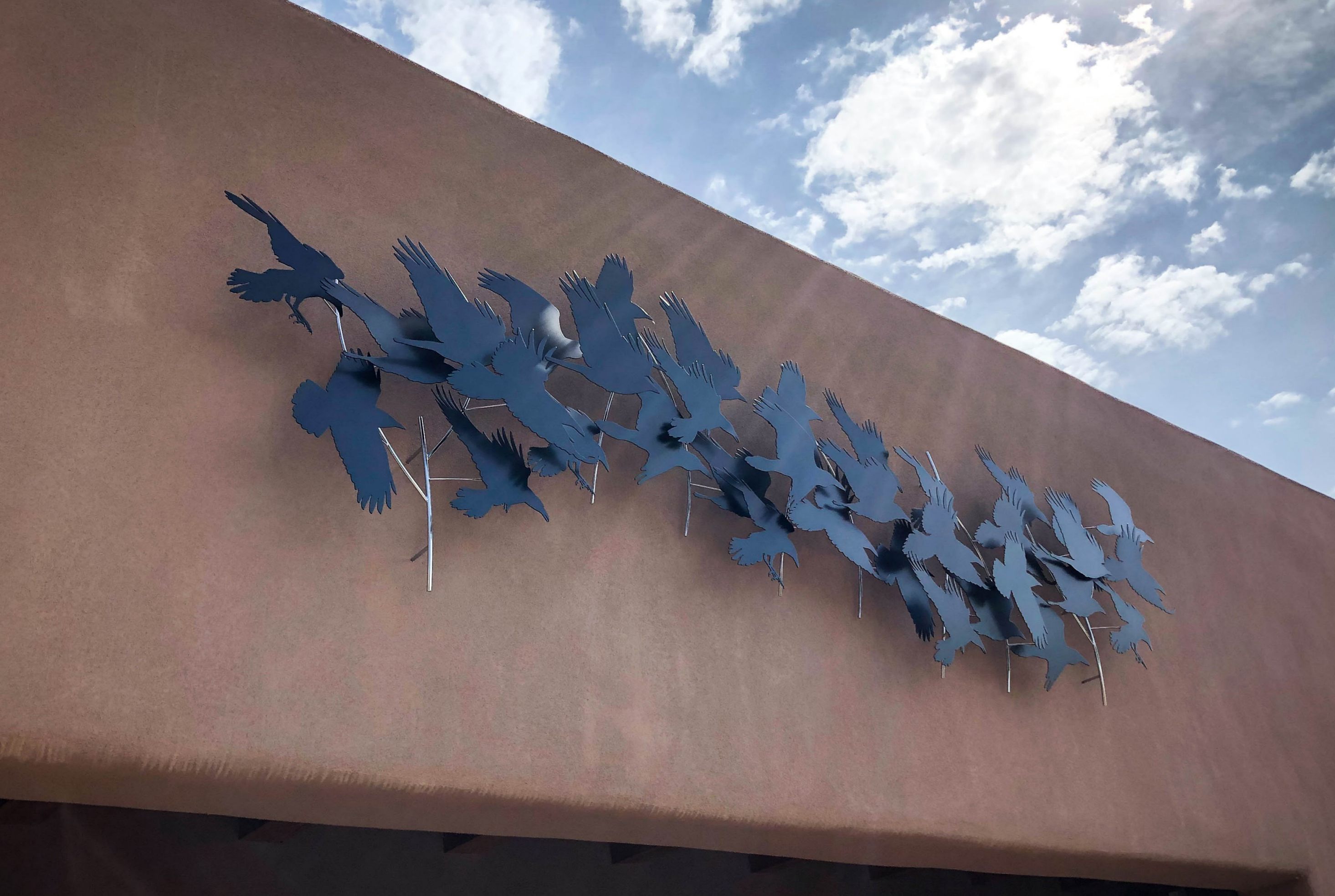
Ravens in flight Santa Fe, New Mexico, US 2019