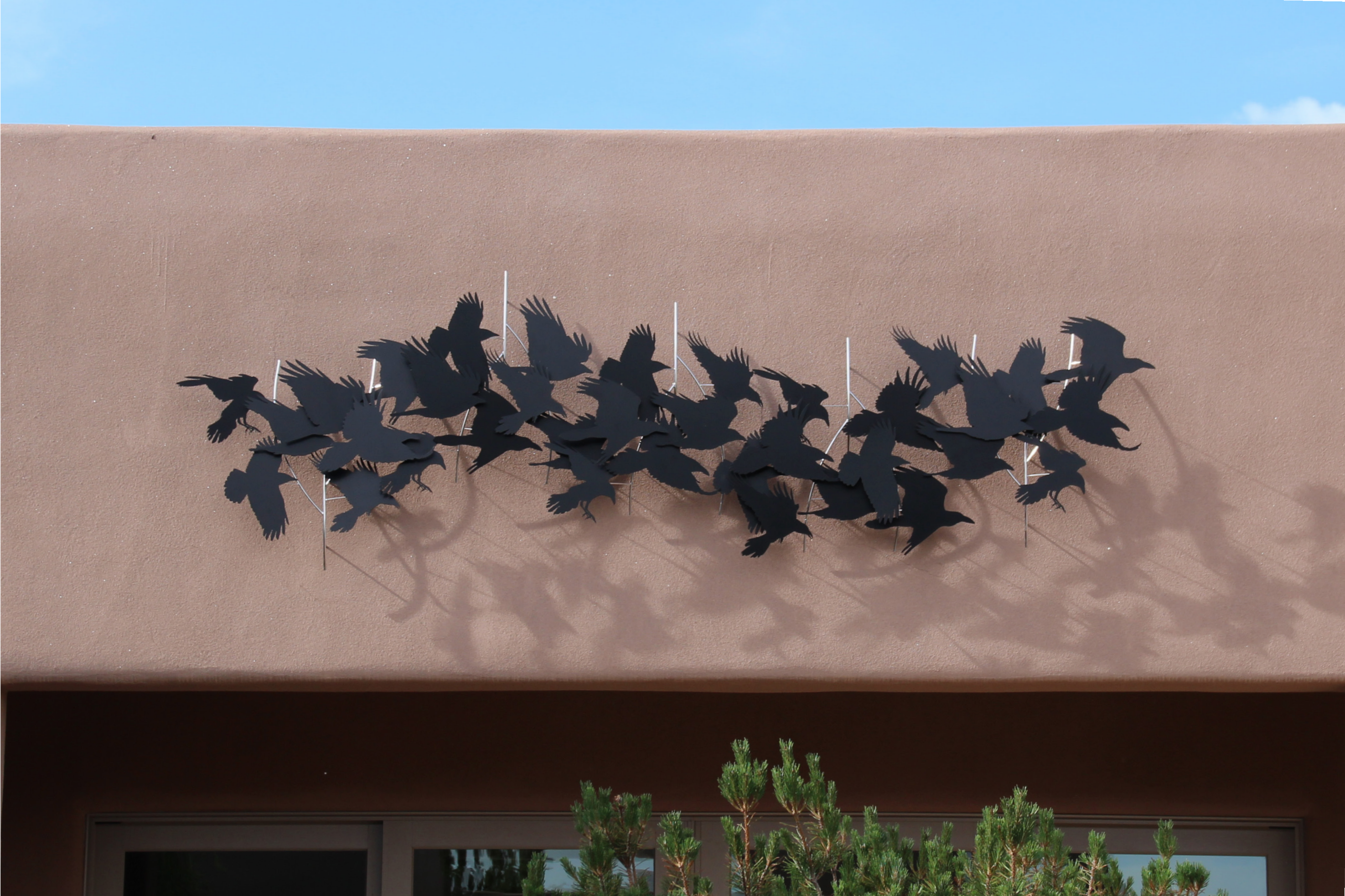
Ravens in flight Santa Fe, New Mexico 13 06 2019