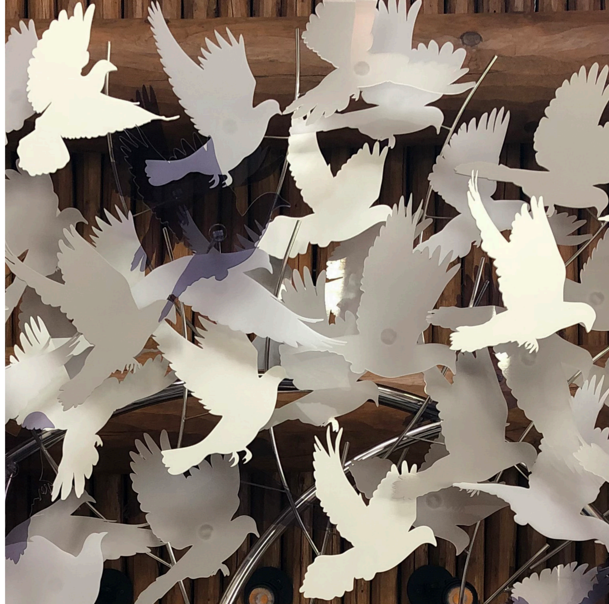
Santa Fe Doves Laser cut plexiglass

The artwork is site-specific and takes into account the size and proportions of the interior space. The lighting design for the artwork compliments the interior space creating a canopy of defused light and casting soft shadows. The colours used in the artwork are mostly light with the darker shade being transparent, allowing more light to pass through. The installation is not a chandelier, and the lighting for the artwork is essential and has to work for the piece as well as the interior space.