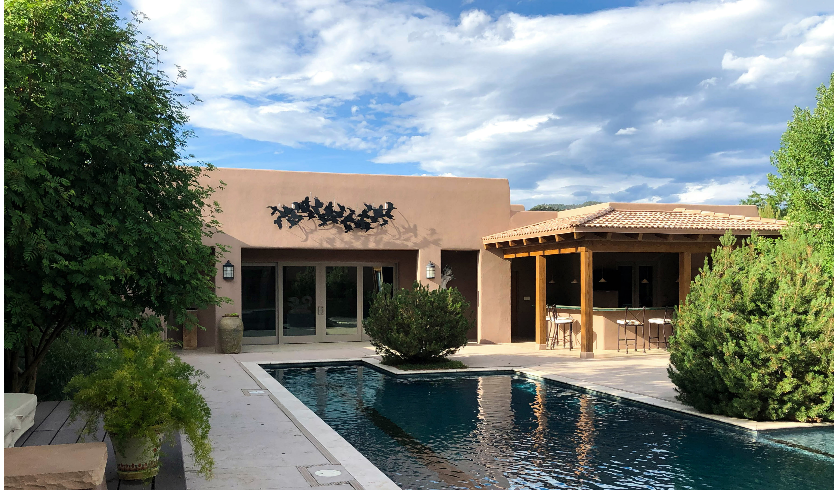
Ravens in flight 13 06 2019 Stainless steel 860 x 3660 x 300 mm